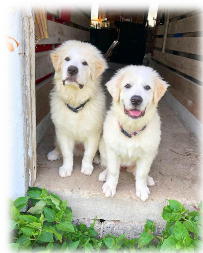
Bo and Zoe - 2020 Calendar cover pups (aka WINNERS!)