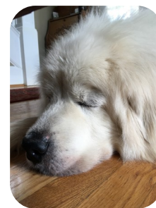
MARCH – Cotton