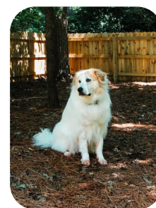
JULY – Daisy