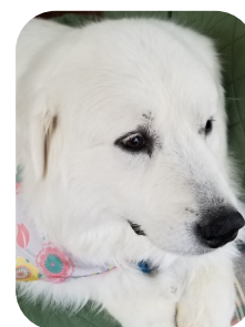
DECEMBER – Sophie