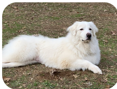
SEPTEMBER – Ginny