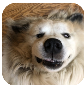
NOVEMBER – Nanook