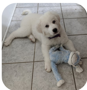
NOVEMBER – Misty Blue