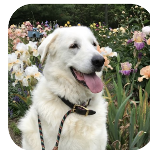
OCTOBER – Savannah