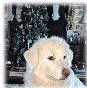
Nonny - 2021 Calendar cover winner

us at agpr-news@verizon.net . The calendars should be ready for shipping right after Thanksgiving. Many thanks to all of you who "played" and supported AGPR! We are so very grateful.